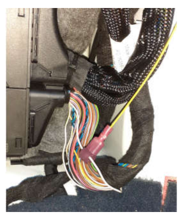
FIG 2 - Brake Switch over pedal